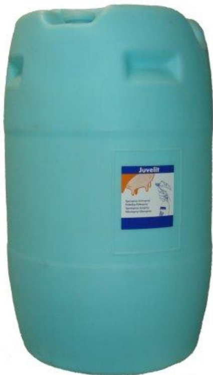
Juvelit-micro 200L Barrel art.no. 84303

Juvelit-micro Product should be diluted 1 part conc. + 4 parts water.