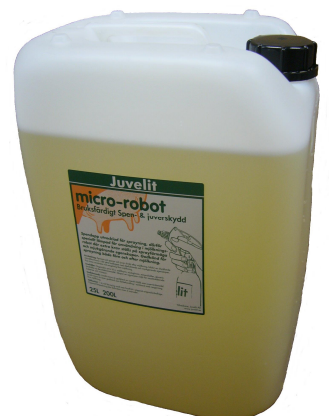
Juvelit-micro 20L art.no. 84300