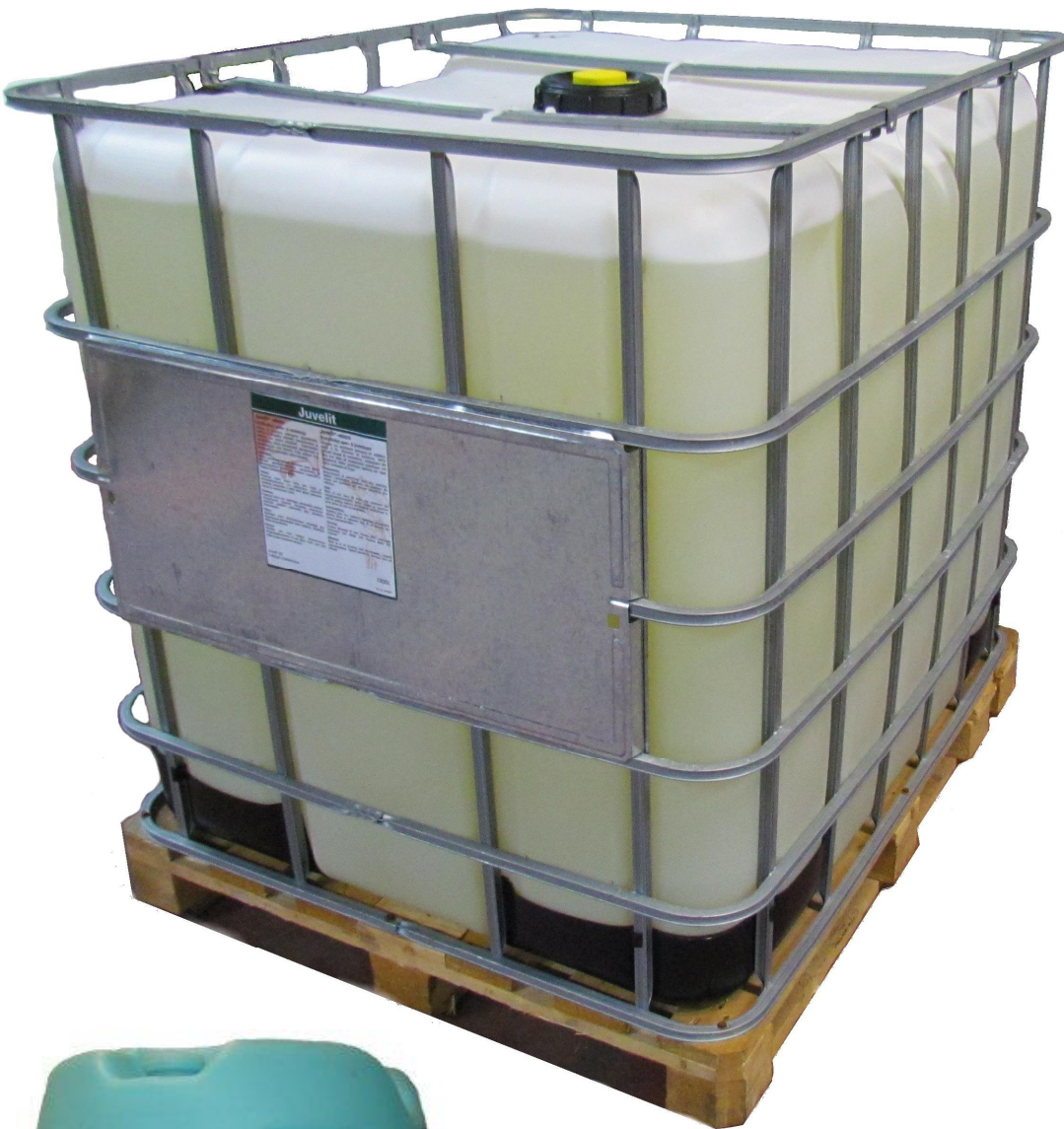
Juvelit-micro 1000L IBC art.no. 84304

Juvelit-micro Product should be diluted 1 part conc. + 4 parts water.